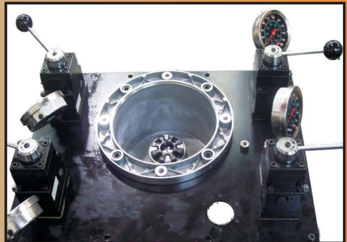
Basic Top Plate Setup

Contact PT Hydraulics Australia for more information