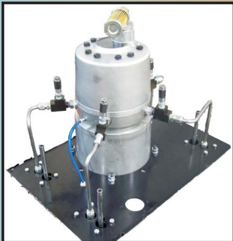
Split Flow Pump