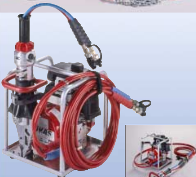
Combi Tool LKS 21 EN Power Unit GO-2L Connection Hose Set 16 in. / 5 m Weight: 57.1 lbs / 25.9 kg