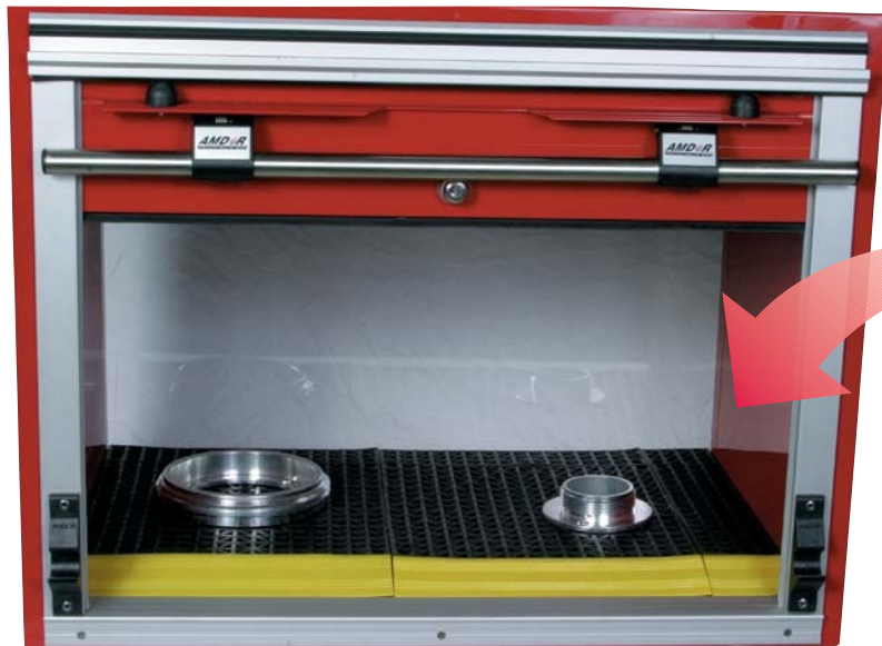
Ramps are optional.

MOUNT BRACKETS & CLIPS DIRECTLY TO TILE!